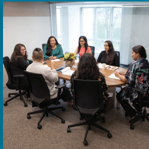
St. George Centre